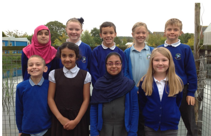
The Newsletter team.

We are the new newsletter team and we will be keeping you up-to-date with what Short Wood is doing. If you have anything you would like featured in the newsletter, please email us at 824.newsletter@taw .